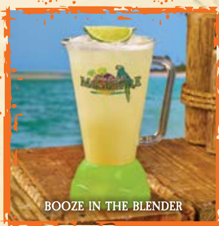
BOOZE IN THE BLENDER

Corazon® Blanco Tequila, Margaritaville Triple Sec, wildberry purée, and our house margarita blend. Served on the rocks (280 calories)